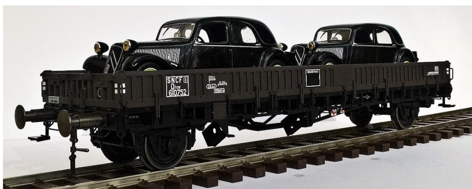
<Item S63227-1 : Steel sided, loaded(*) with Citroën Traction Avant 11CV (1952)

It will help you wait for : two era 3 samples, loaded(*) as they were in 1950', will be shown in Chartres !