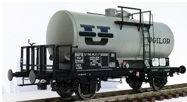
Réf. 37264 : SNCF / Ugilor, era 3.