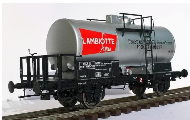
Réf. 37266 : SNCF / Lambiotte, era 3.