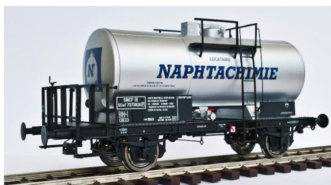
Réf. 37265 : SNCF / Naphtachimie, era 3.